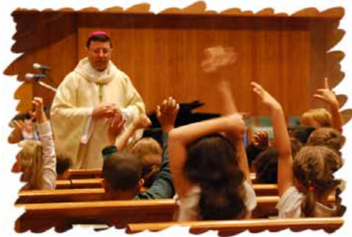
First all-school Mass (September 15, 2010) at St. Richard's Church with Bishop Piche' presiding. What a treat for the students!