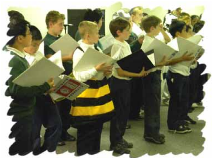
Fourth graders singing to St. Peter's Seniors' Club.

We have experienced, dedicated teachers and support staff, as well as involved parents who actively volunteer to enhance the life of our school. Please tell your friends and neighbors about Blessed Trinity. Give them our enclosed open house flyer. Invite them to schedule a private tour or browse our website at www.btcsmn.org .